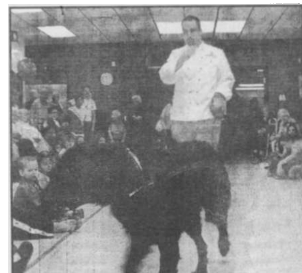
First Annual Dog Show

The dogs were well behaved. At the end, the dogs were walked around the room again and "visited" with members of the audience. Everyone present enjoyed the show and urged that it become an annual event.