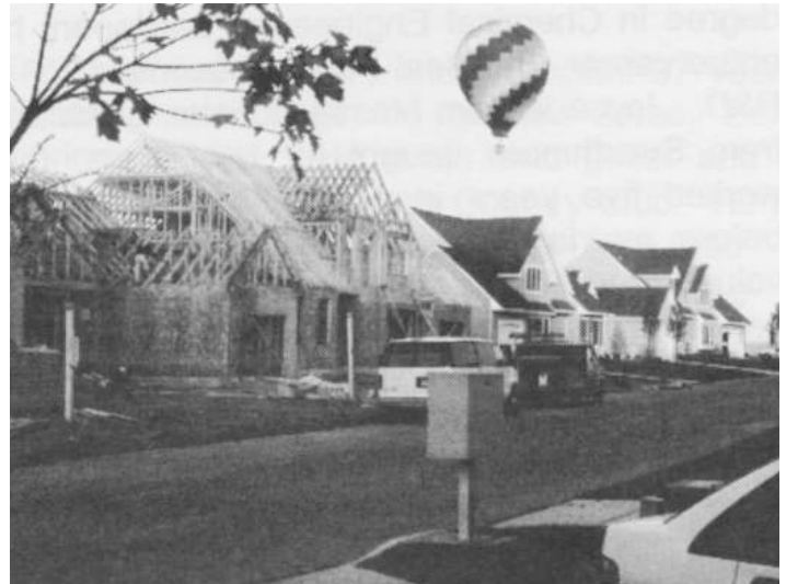
Lumberton Leas under construction (with hot air balloon drifting by)

Marge & Milt Zimmerman , February 2000, 210 Woodside Drive