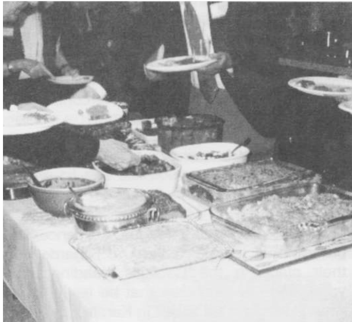
The buffet table at one of the many gatherings