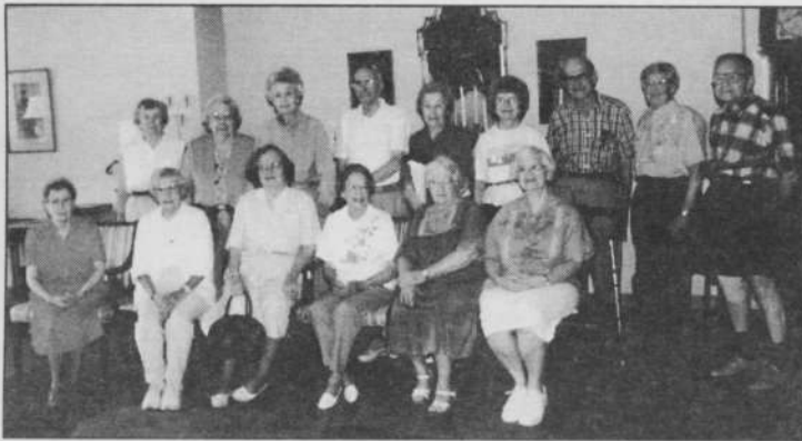
Some of the Health Volunteers

When I originally joined the health volunteers, we were just a small group starting out. Now we have grown to about 45 members. Meanwhile, Medford Leas has grown also with the addition of outlying communities, so more volunteers are needed. Our volunteers push wheelchairs, visit and read to residents, help with regular recreational activities such as the Sing-Along, the Coffee Hour, and special events in the Auditorium. Some of us water plants in Woolman, help serve meals, accompany trips, play the piano and organ, and help out when there is a picnic or special sports day, shuffleboard, croquet, etc. in the Activities Room. I know I receive more than I can give. Please join us; we need you.